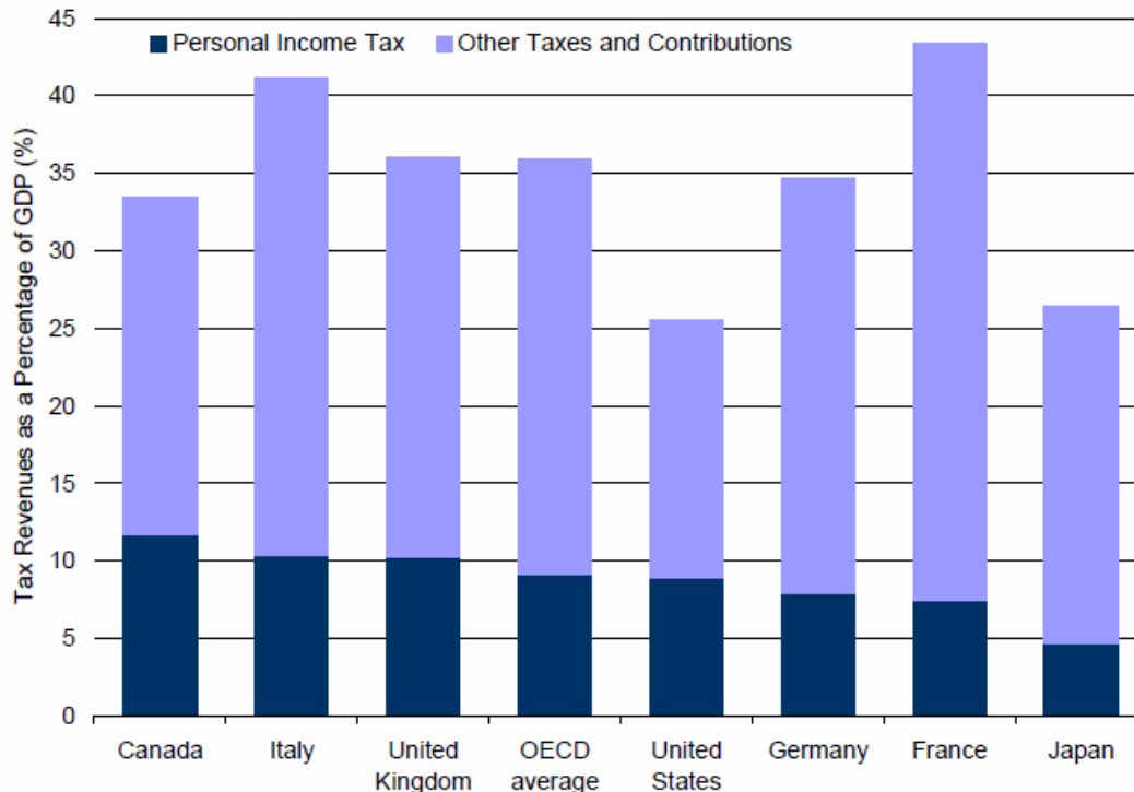
Figure 2 – Tax Revenues as a Percentage of Gross Domestic Product, 2004